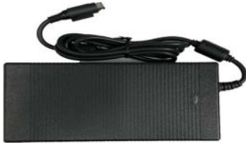
COM421 External Power Supply

The COM421 chassis is designed for lower channel count installations, and Flexitone.