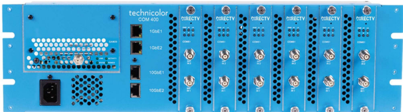
COM400 with QAM4 and COM51D