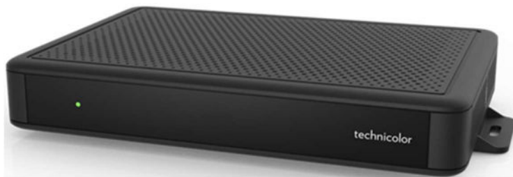
AEP Set Top Box

Both models use the similar external case