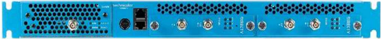
COM421 with QAM4 and COM51D